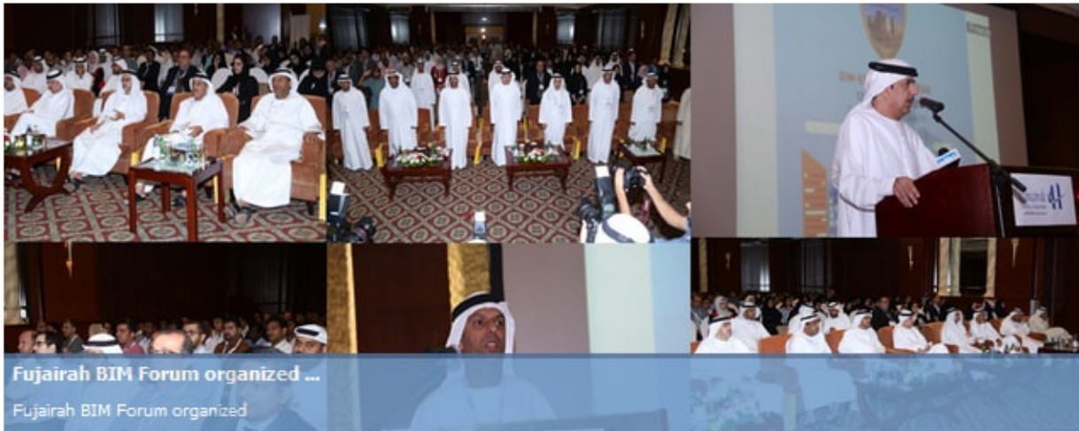
Fujairah BIM Forum organized ... Fujairah BIM Forum organized